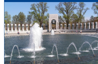
World War II Memorial